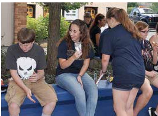
Student Council brunch

On Friday, September 9, we hosted the new student brunch out in the court yard to welcome the new students to our school. We enticed them with pizza and snacks while we introduced our administration and made sure they could find us if they needed us. Hopefully, this time together gave them a